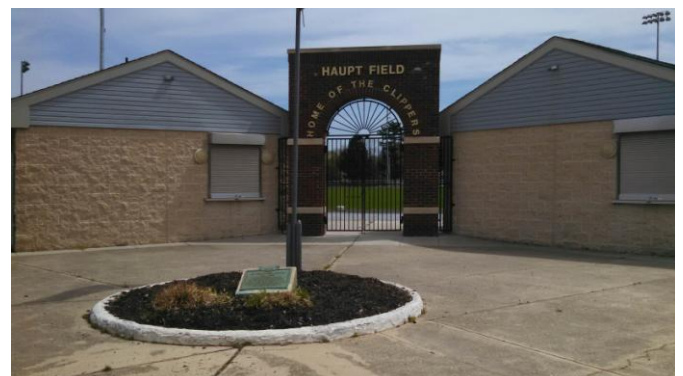
PHOTO ABOVE: April 19, 2016. HAUPT FIELD, Home of the Clippers. In the far right upper corner, one can see the new lights installed in 2015.